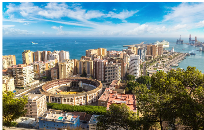
Malaga, on the Costa del Sol (coast of the sun), Spain

An Ancient Chinese Philosopher once said, “ Being deeply loved gives you strength. Loving deeply gives you courage ”. This is universally true, but to a Christian it speaks of God’s love and the strength we draw from it, and of the courage to care through the extension of this love to others.