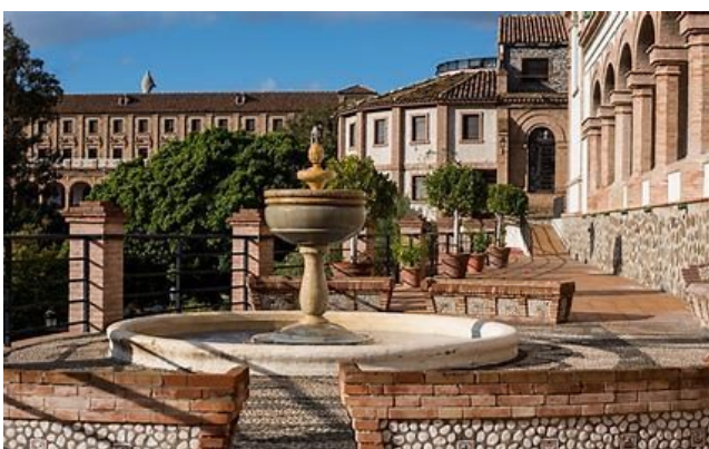
Conference venue, Casa Diocesana, Malaga, Spain.

We acknowledge the importance of those concepts in nursing, and note the focus on moral courage and strength based nursing in current nursing literature. The need for strength and courage is not exclusive to Christian nurses and midwives, and we hope that those of other faiths and no faith will also be interested in exploring a Christian perspective on these two issues. The theme's title and subtitle will provide a rich opportunity to do this, both through both professional papers and and Bible teaching.