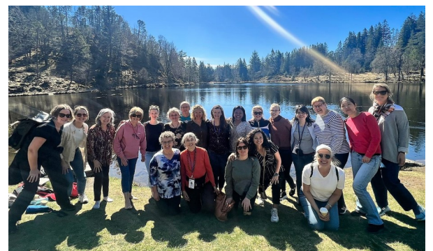
Group excursion. See next page for more pictures.

Time together included a trip to the mountains to enjoy some of the beautiful scenery around Bergen. Venue for the conference was the VID Specialized University in Bergen.