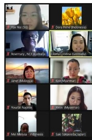
Participants in the Next Gen online Leadership Course