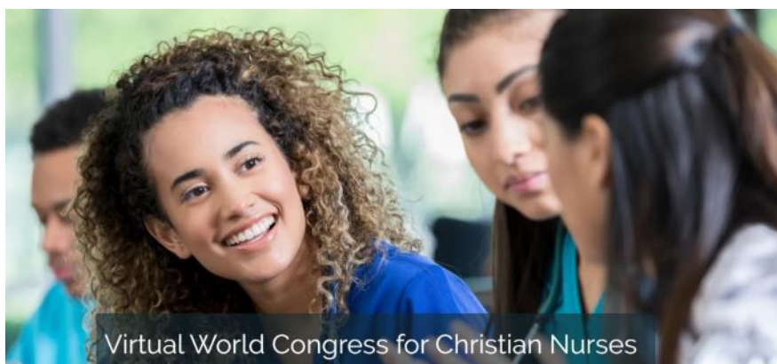
Virtual World Congress for Christian Nurses