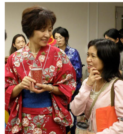
PACEA Leaders Conference Taiwan