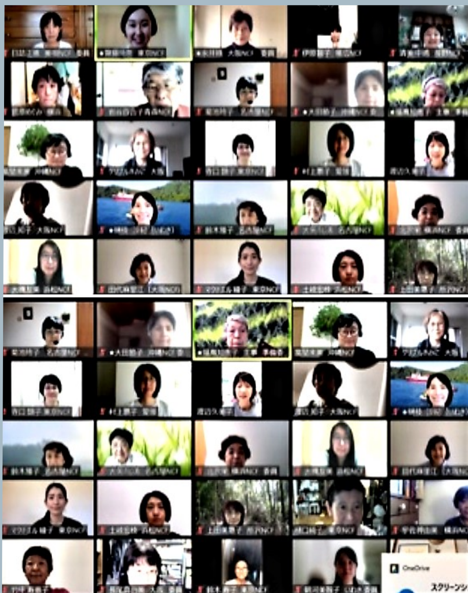
Japan NCF National Conference attendees