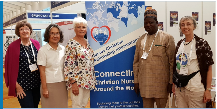
Photo: NCFI Display Booth, ICN Congress Singapore