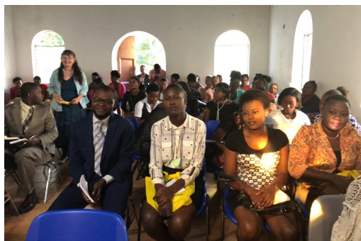
Caribbean and North American delegates

THE NCFI CANA REGIONAL CONFERENCE took place at the Christian University of North Haiti (UCHN) from January 10-13, 2019. The theme was "Infusing Hope in Nursing: A Christian Perspective" .