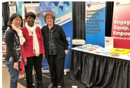
NCF-NCFI Display Booth at Missionfest